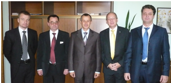
At the National Bank of Belarus

Ukraine & Belarus to representatives from local banks in the afternoon. ACI's President talked on the advantages of the International ACI Association, its programme as well about actual market developments.