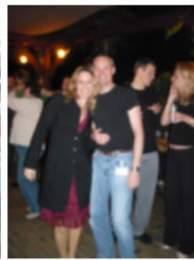
BBQ Dinner at the Restaurant Ondina, Portoroz